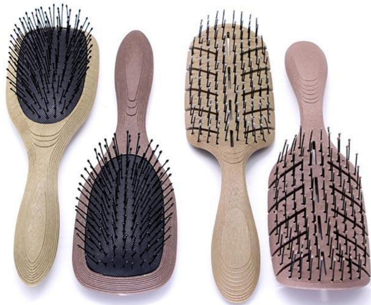
Biodegradable Hair Brush