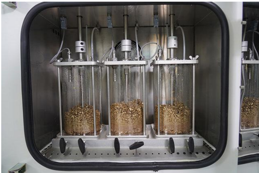
Compost Degradation Analyzer