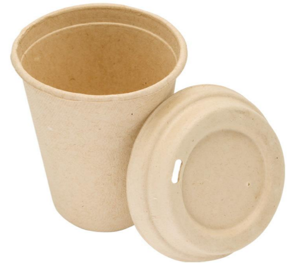
Biodegradable Coffee Cup