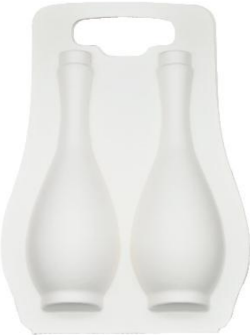
Wine Bottle Tray