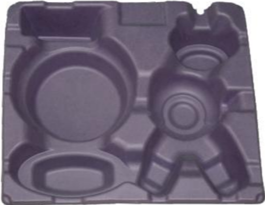
Spare Parts Packaging