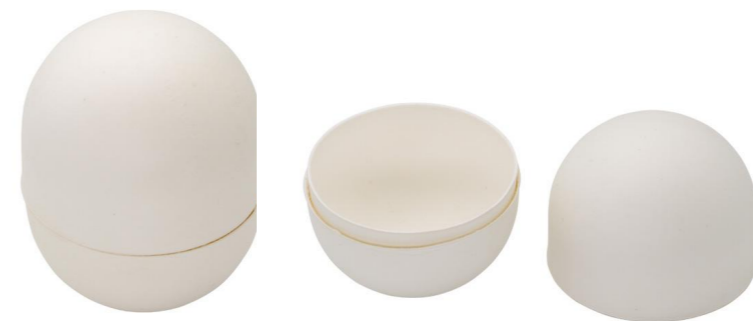
Biodegradable tea cup