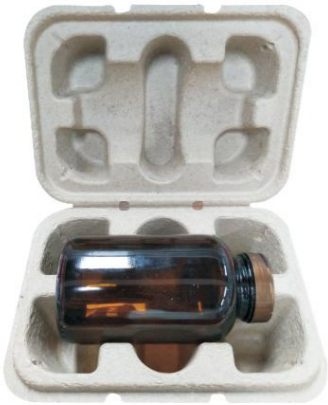
Glass Bottle Box