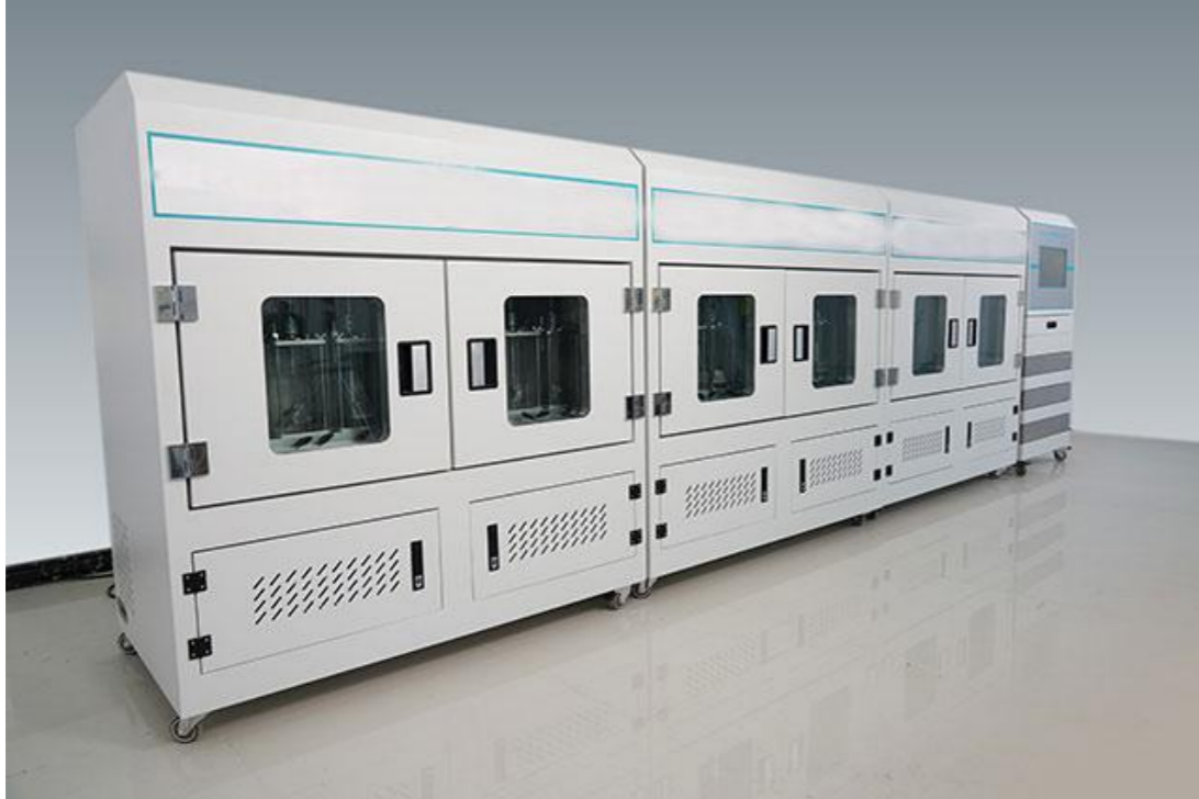
Automatic Biodegradation Analyzer